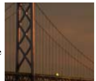
FATHERS ARE THE BRIDGE TO A CHILD'S FUTURE!

LORD: And he shall turn the Heart of the Fathers to the Children, and the Heart of the Children to their Fathers, lest I come and smite the (whole) Earth with a curse (disease, net) It's high time to turn back our Heart to our Children!