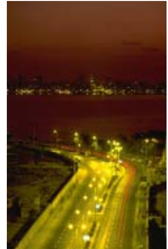
Bring up a child in the way he should go and afterwards he will not depart from it.

plenty of hours left to give to your Job and friends, your career and your other interests. Spend your money on your children, while they will still let you. For the day of Independence calls out to them.