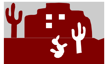
Your house is left you desolate!

Today, the Kingdom of Heaven is well underway! Yet the Religious neither